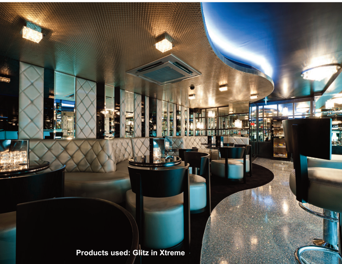
Products used: Glitz in Xtreme

Galante, an Argentinean inspired bar in Kensington, London opened its doors January 2012 to reveal a lavish environment inspired by one of Argentina's most revered bartenders, Santiago "Pinchin" Policastro. Located adjacent to Gaucho, the Argentinean steakhouse restaurant chain, Galante's 1930's décor, including curvy leather banquettes and incandescent back lit island bar, encompasses the definition of glamour.